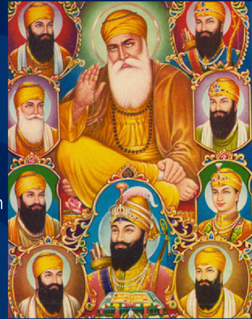
The Ten Gurus

Sikhs take off their shoes and cover their head before approaching the book and will bow in front of it, in reverence to the wisdom it contains.